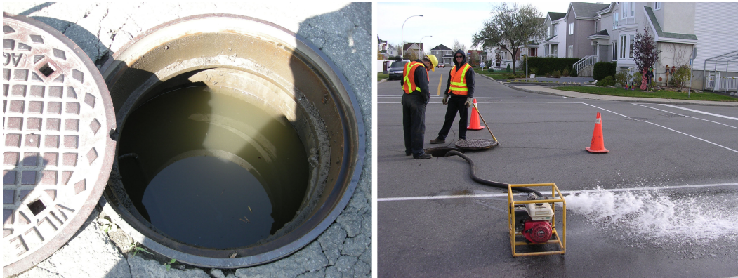
Fig. 1. Flooded air-vacuum valve vault.