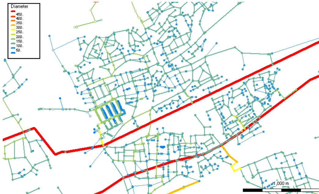
Fig. 1. Part of a distribution network. The line color and thickness represent the diameter of the pipes, the blue circles are demand nodes, open circles are nodes with zero demand. The thick yellow, orange and red lines are typically mains with a transport function (i.e. large diameters and very few demand nodes that are directly connected to it); the thin blue and green lines are mains with a distribution function (i.e. supply to customers with small auto and cross correlation).